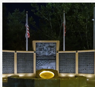
LINCOLN MEMORIAL DAY