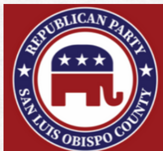
SAN LUIS OBISPO GOP